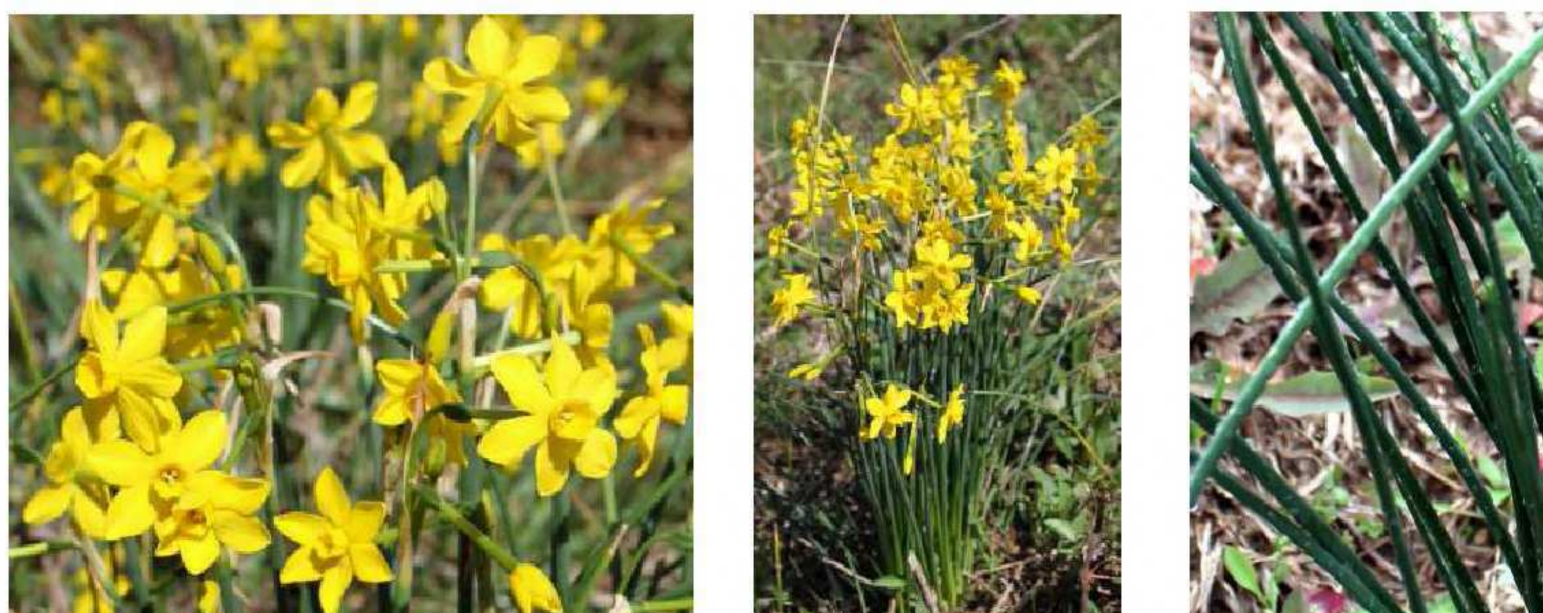
Figure 6. Narcissus jonquilla , roadside, Covington Co., Alabama, 20 Mar 2014.